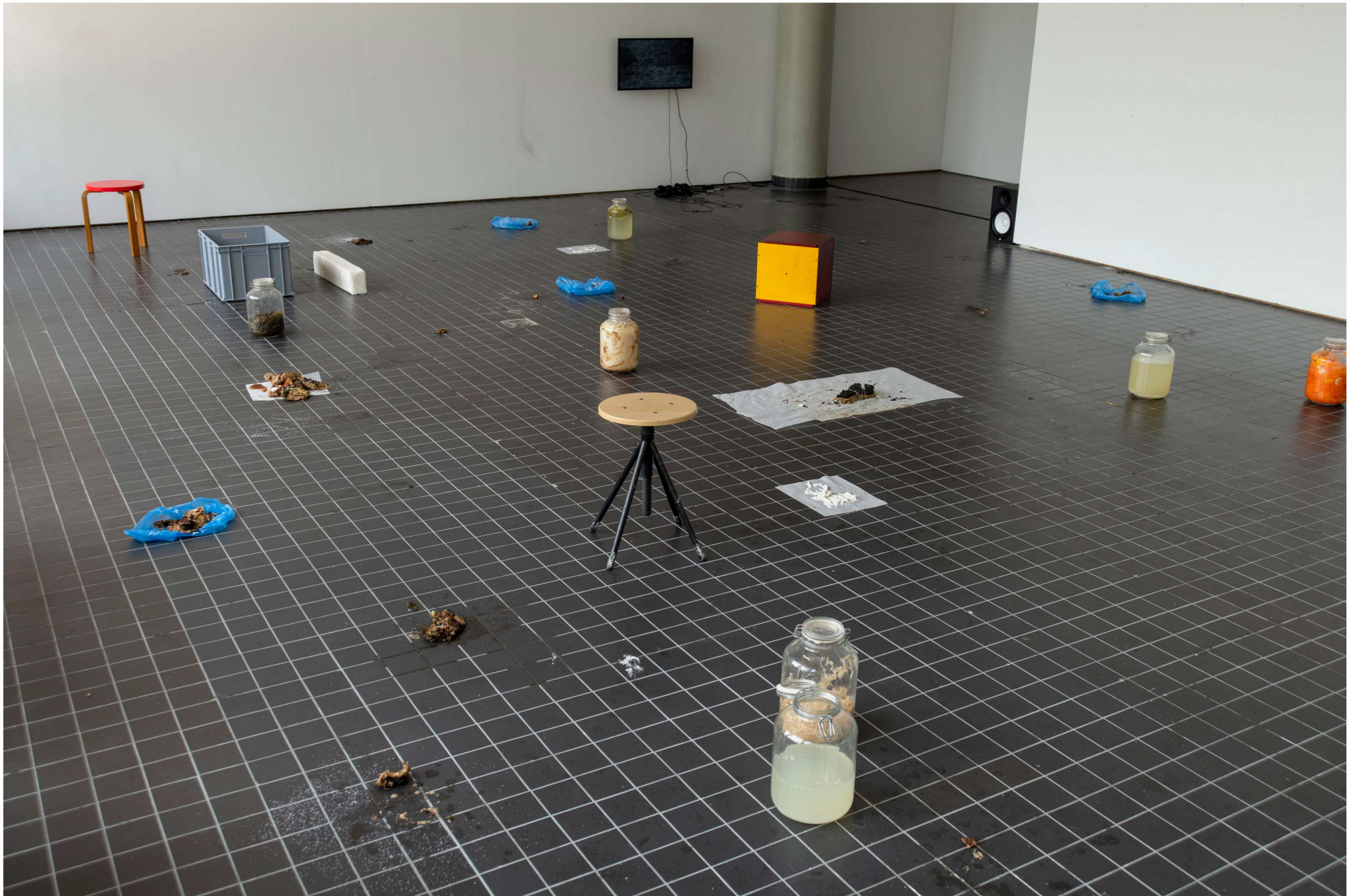
59. soap ( bad acting or the art of destringing pigeons ), 2024 installation view Billytown, The Hague