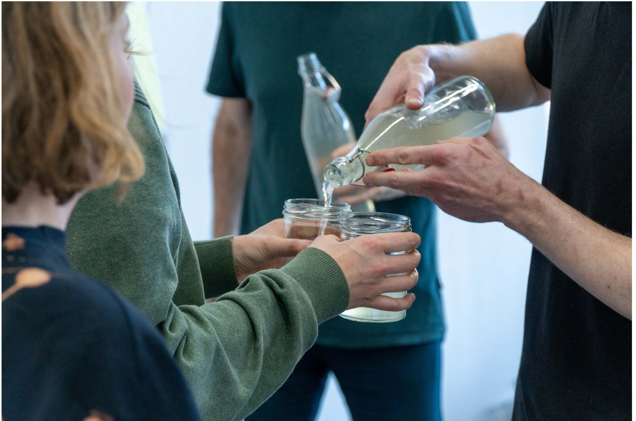
59. soap ( bad acting or the art of destringing pigeons ), 2024 installation view Billytown, The Hague