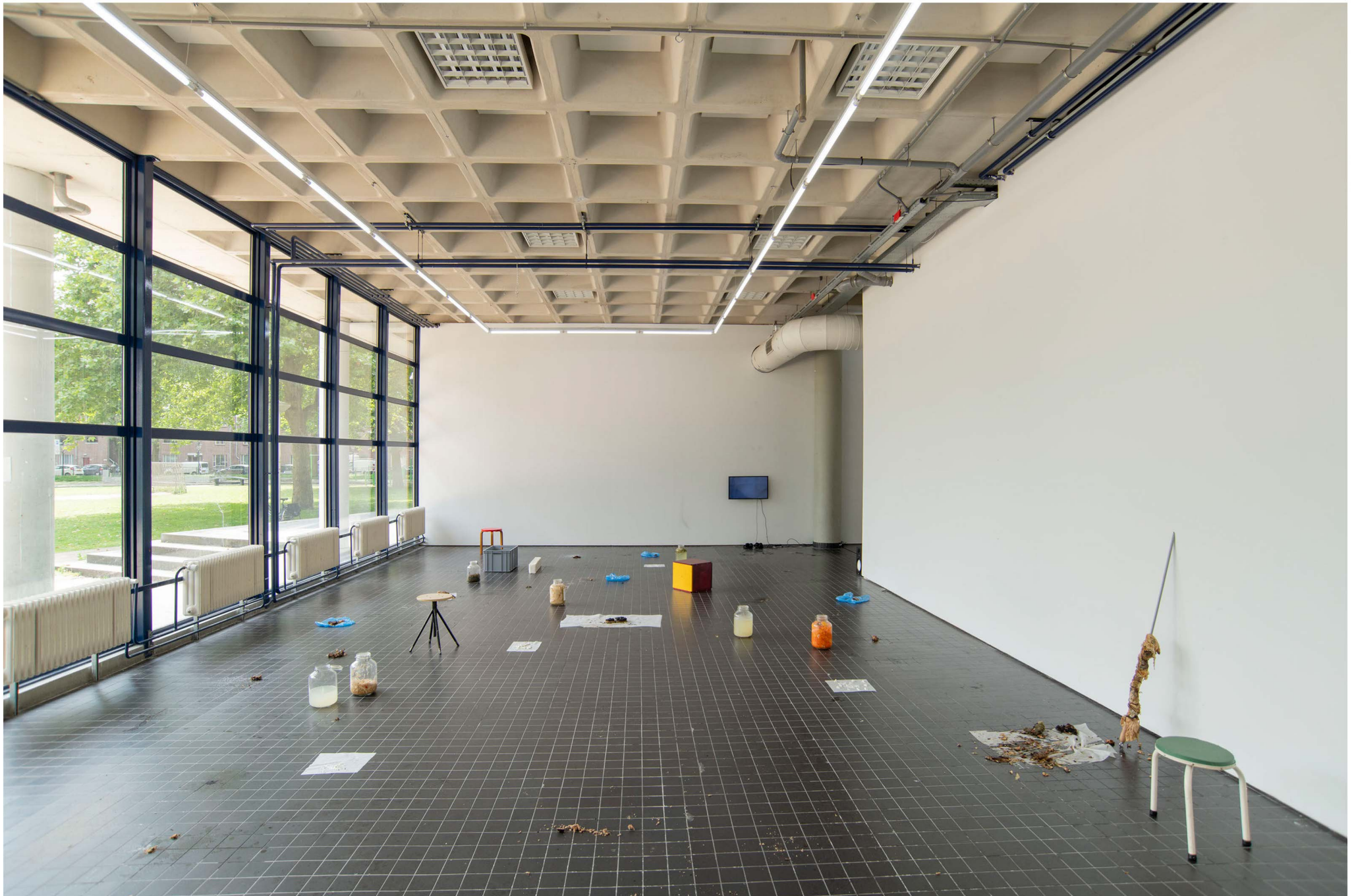
59. soap ( bad acting or the art of destringing pigeons ), 2024 installation view Billytown, The Hague