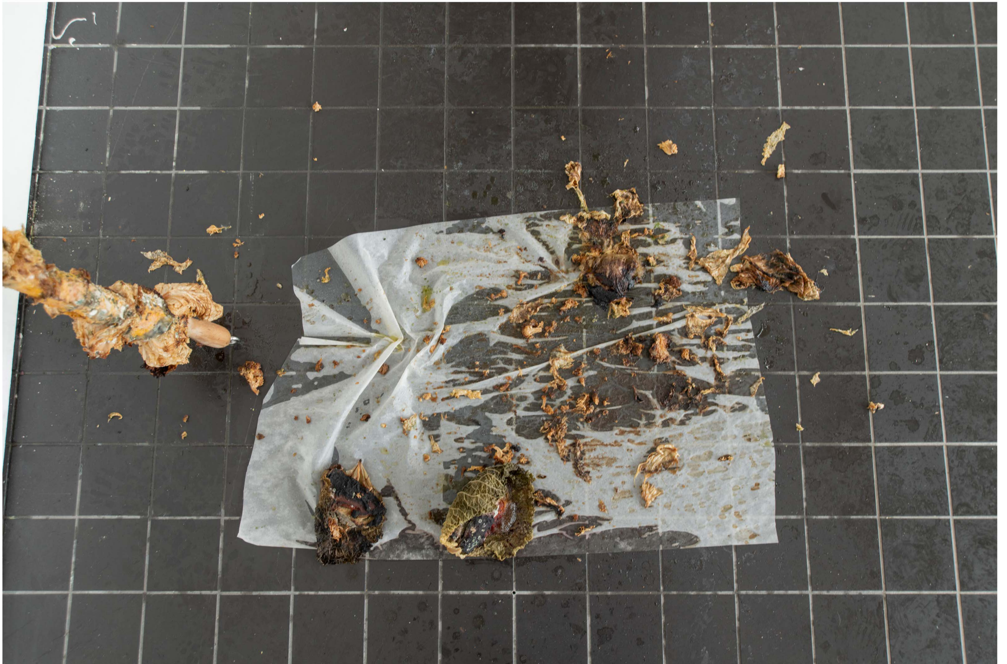
59. soap ( bad acting or the art of destringing pigeons ), 2024 installation view Billytown, The Hague