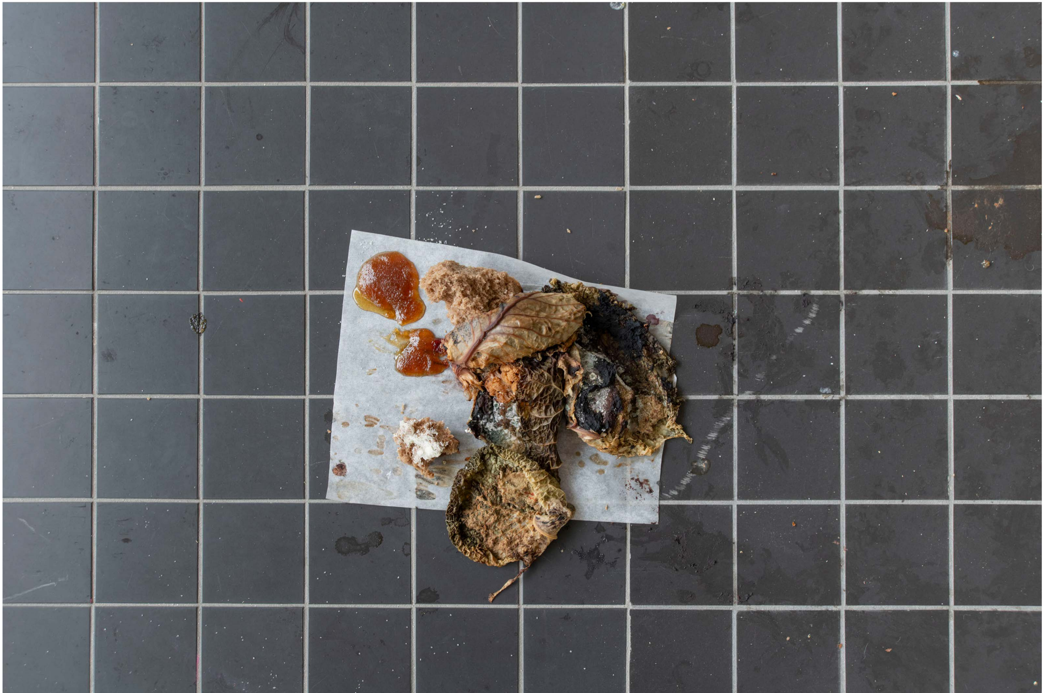
59. soap ( bad acting or the art of destringing pigeons ), 2024 installation view Billytown, The Hague