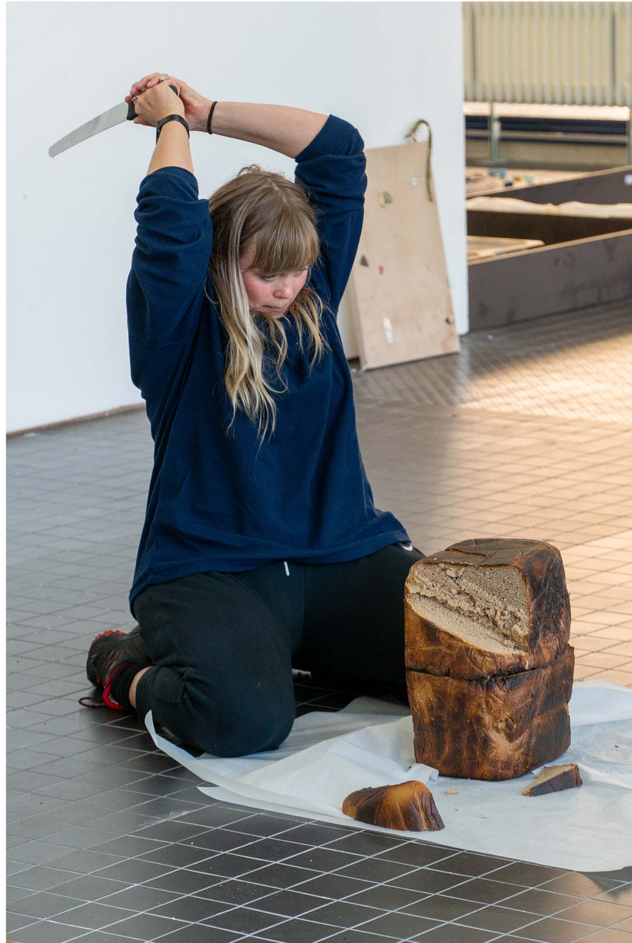
59. soap (bad acting or the art of destringing pigeons), 2024 installation view Billytown, The Hague