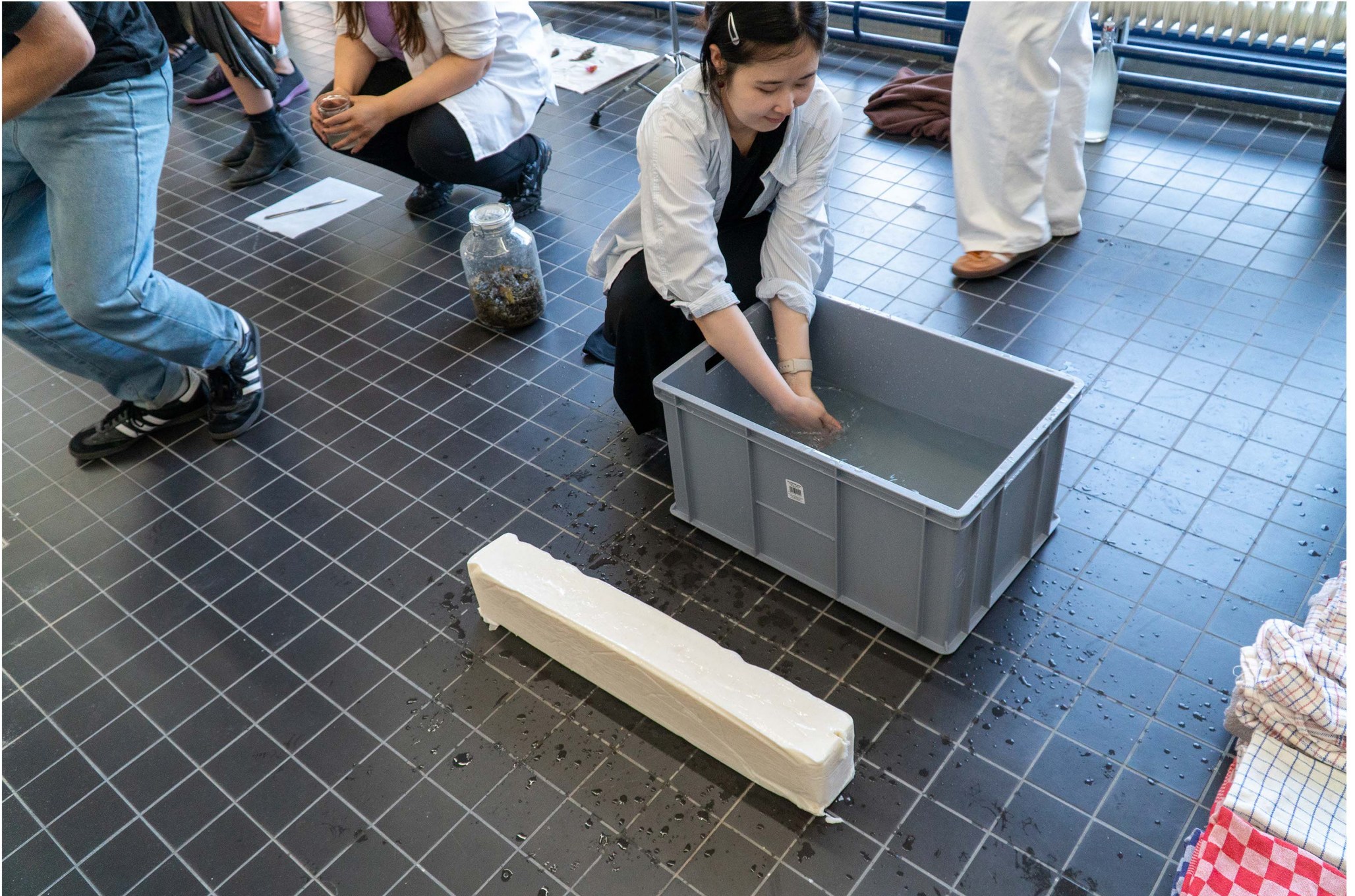
59. soap ( bad acting or the art of destringing pigeons ), 2024 installation view Billytown, The Hague