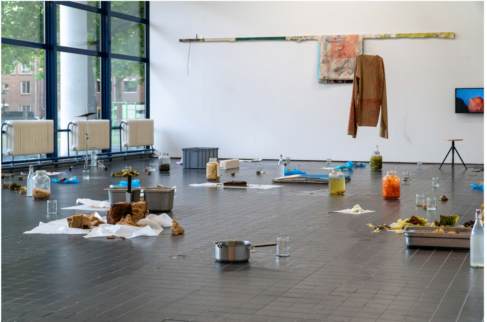
59. soap ( bad acting or the art of destringing pigeons ), 2024 installation view Billytown, The Hague