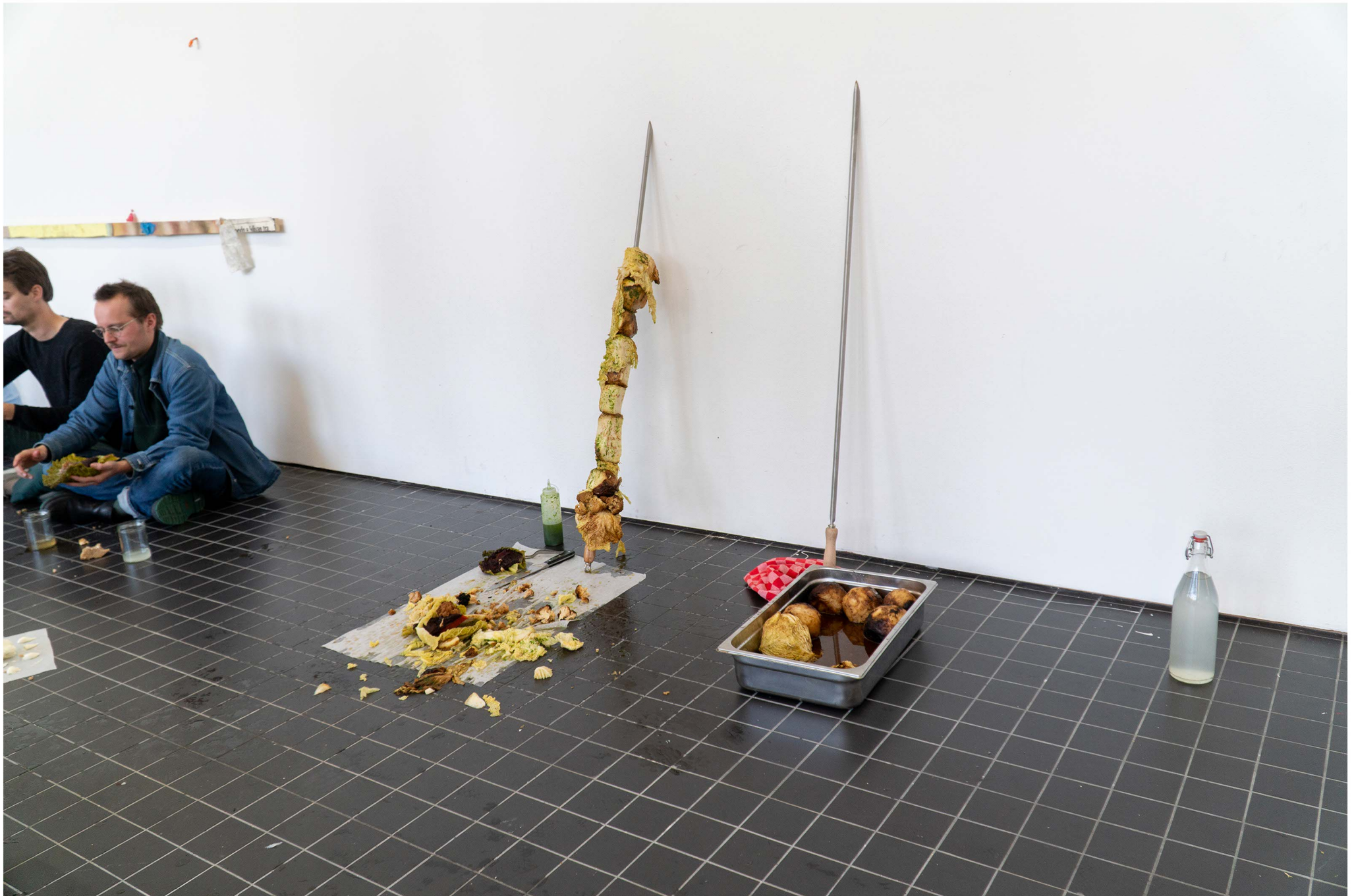
59. soap ( bad acting or the art of destringing pigeons ), 2024 installation view Billytown, The Hague