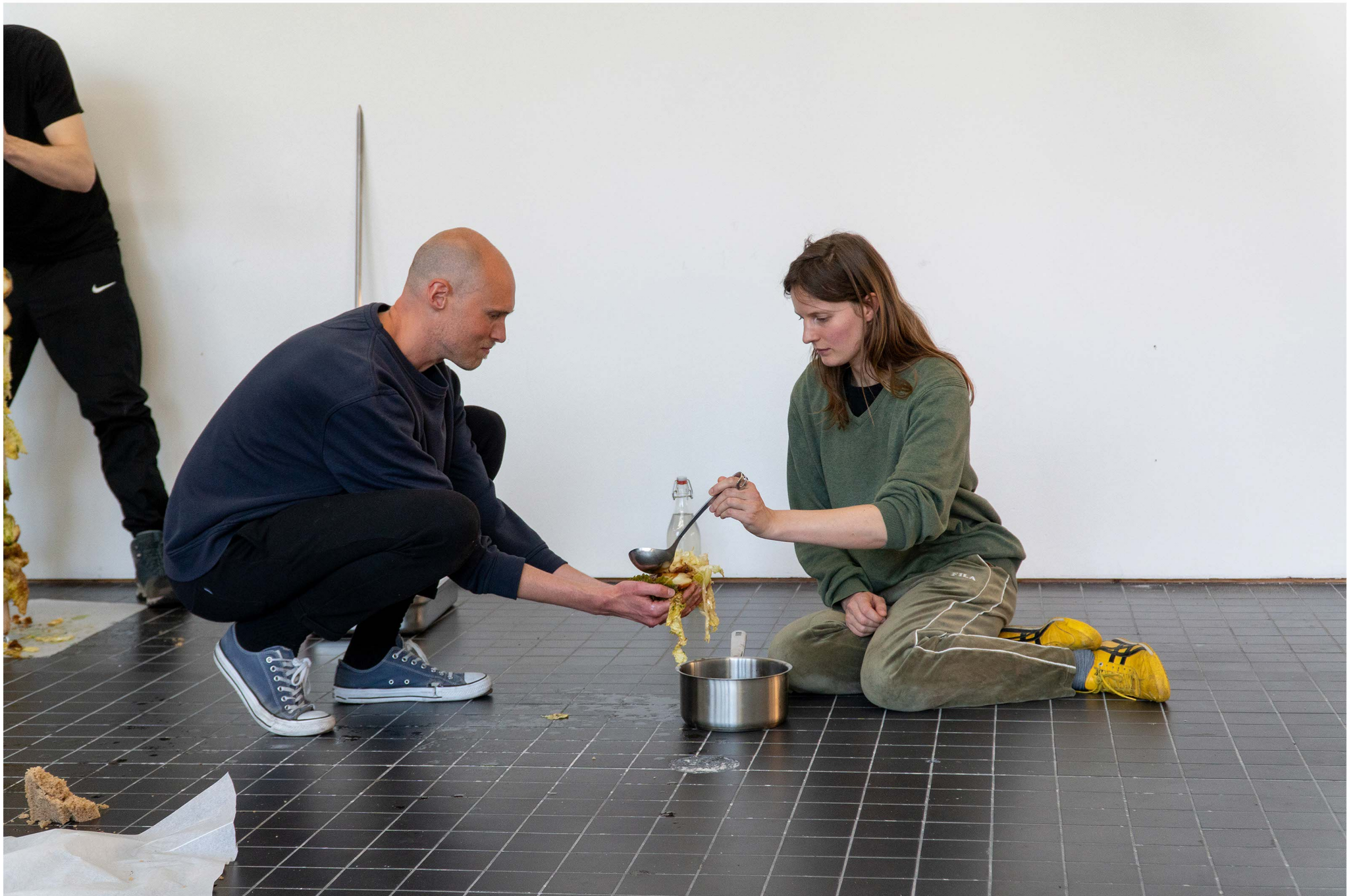
59. soap ( bad acting or the art of destringing pigeons ), 2024 installation view Billytown, The Hague