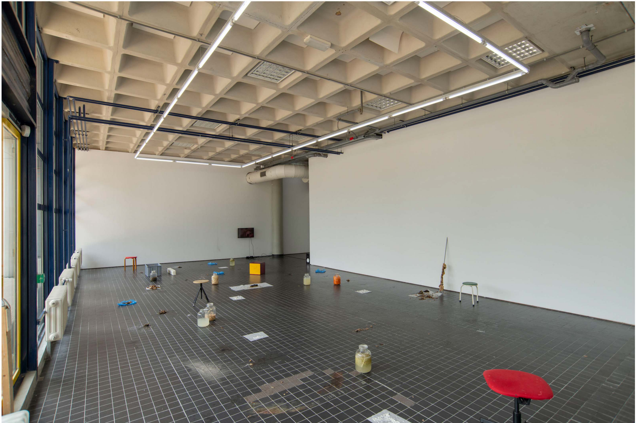
59. soap ( bad acting or the art of destringing pigeons ), 2024 installation view Billytown, The Hague