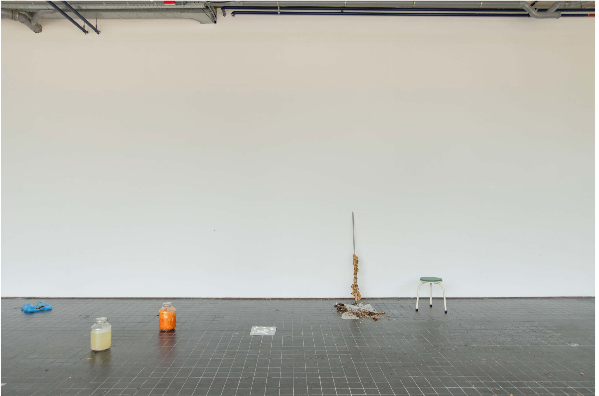
59. soap ( bad acting or the art of destringing pigeons ), 2024 installation view Billytown, The Hague