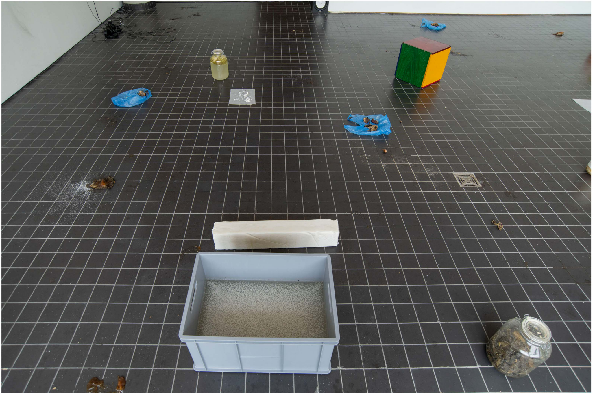
59. soap ( bad acting or the art of destringing pigeons ), 2024 installation view Billytown, The Hague