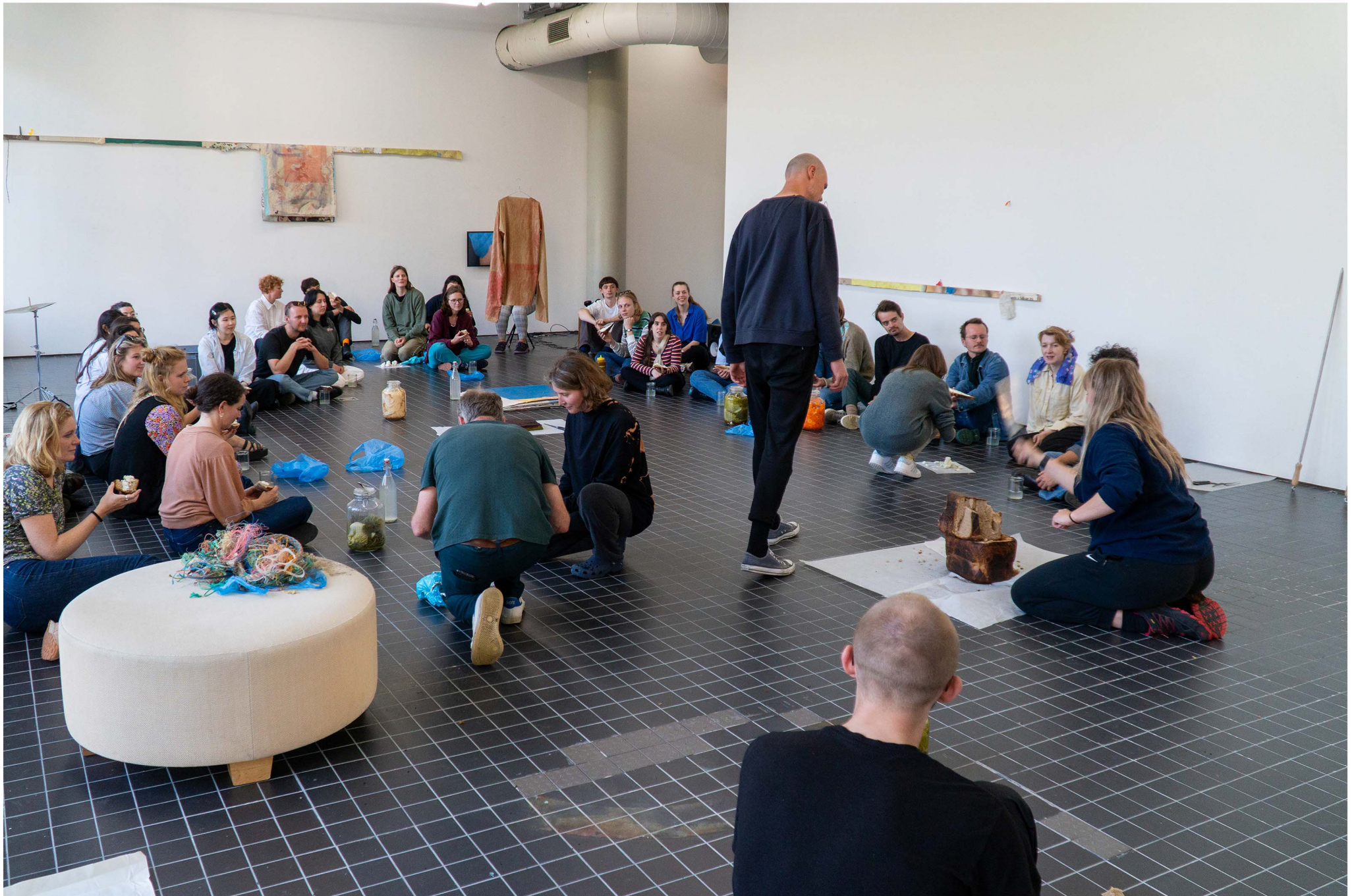
59. soap ( bad acting or the art of destringing pigeons ), 2024 installation view Billytown, The Hague