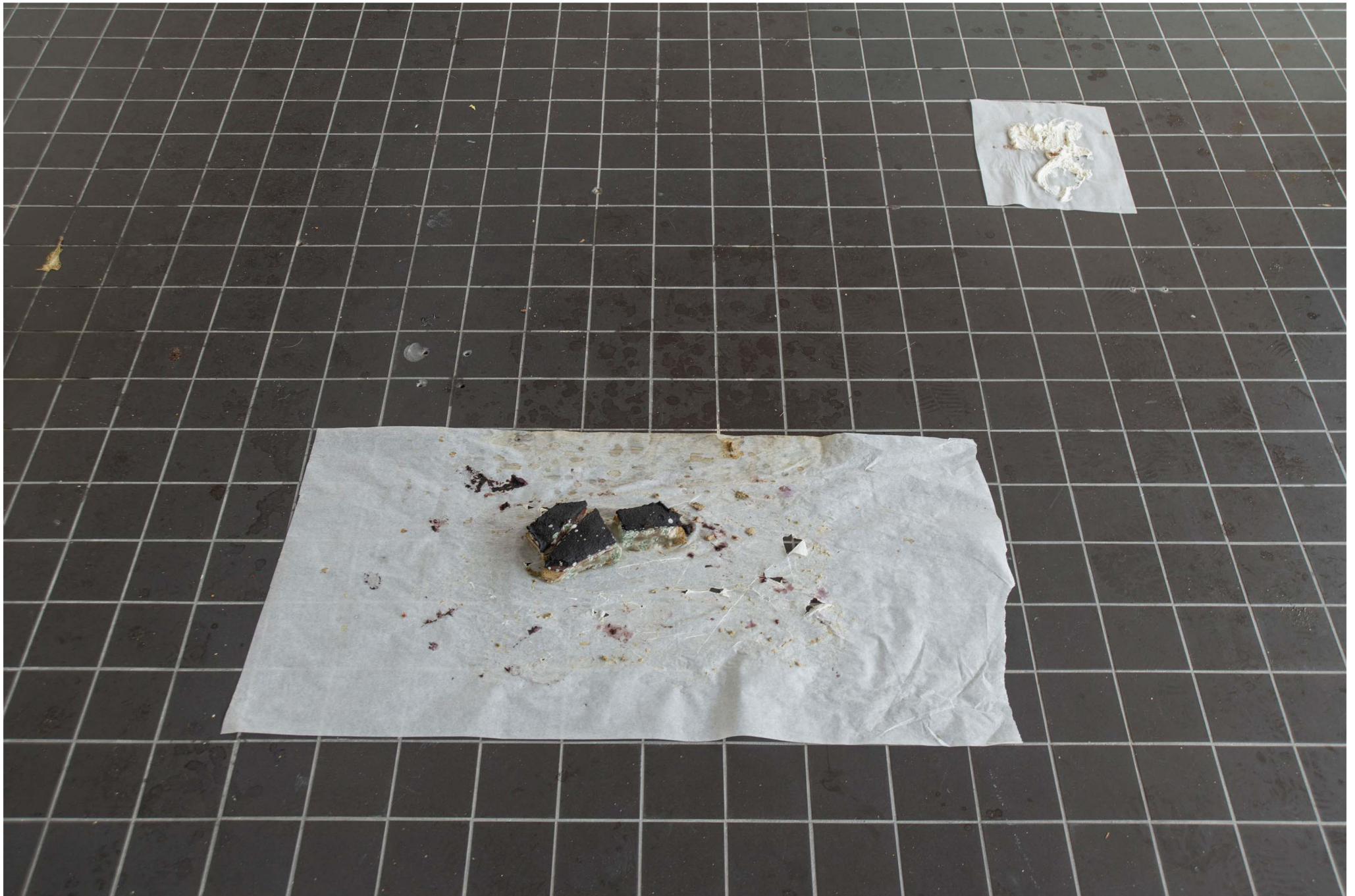
59. soap ( bad acting or the art of destringing pigeons ), 2024 installation view Billytown, The Hague