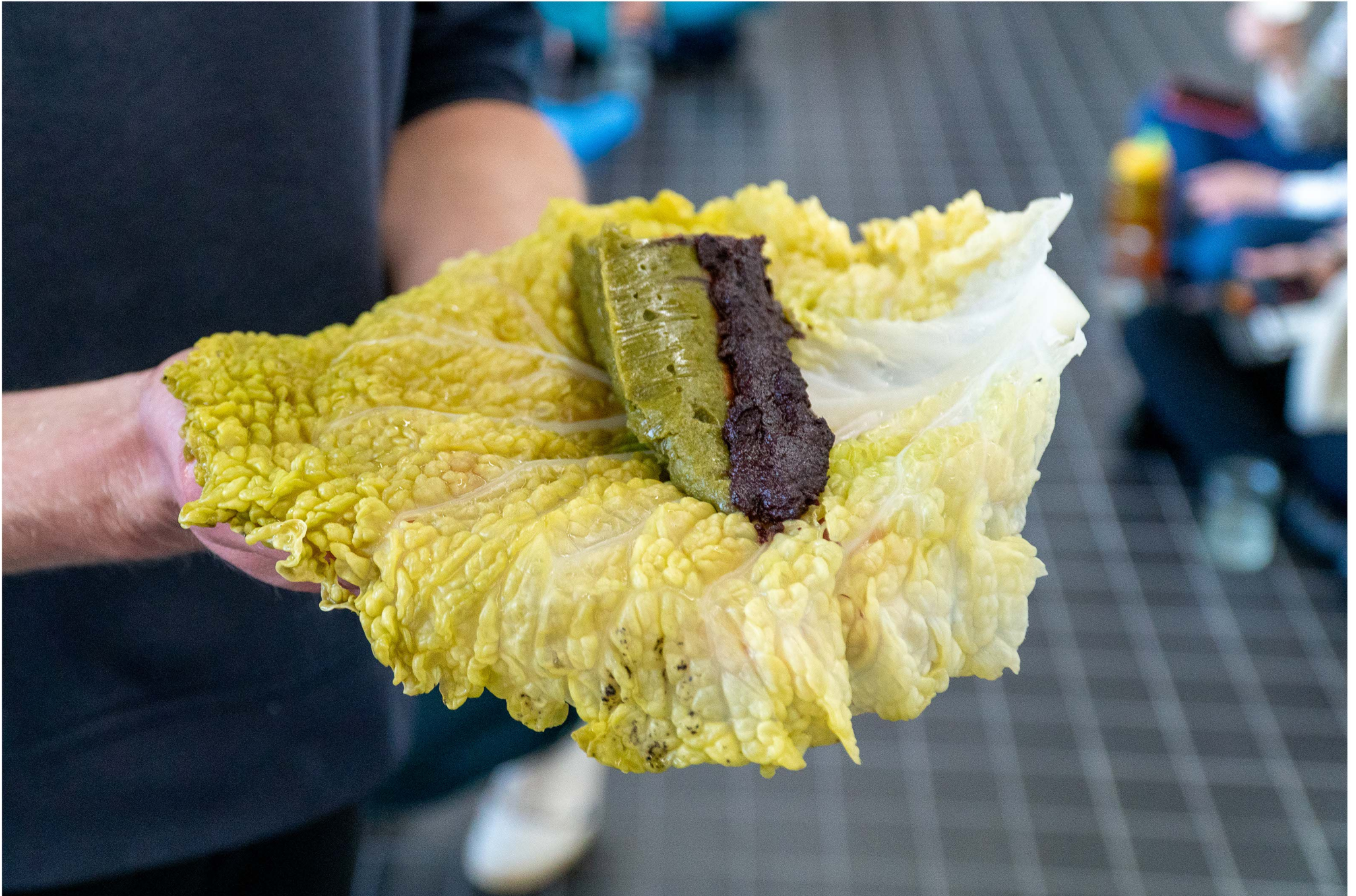
59. soap ( bad acting or the art of destringing pigeons ), 2024 installation view Billytown, The Hague