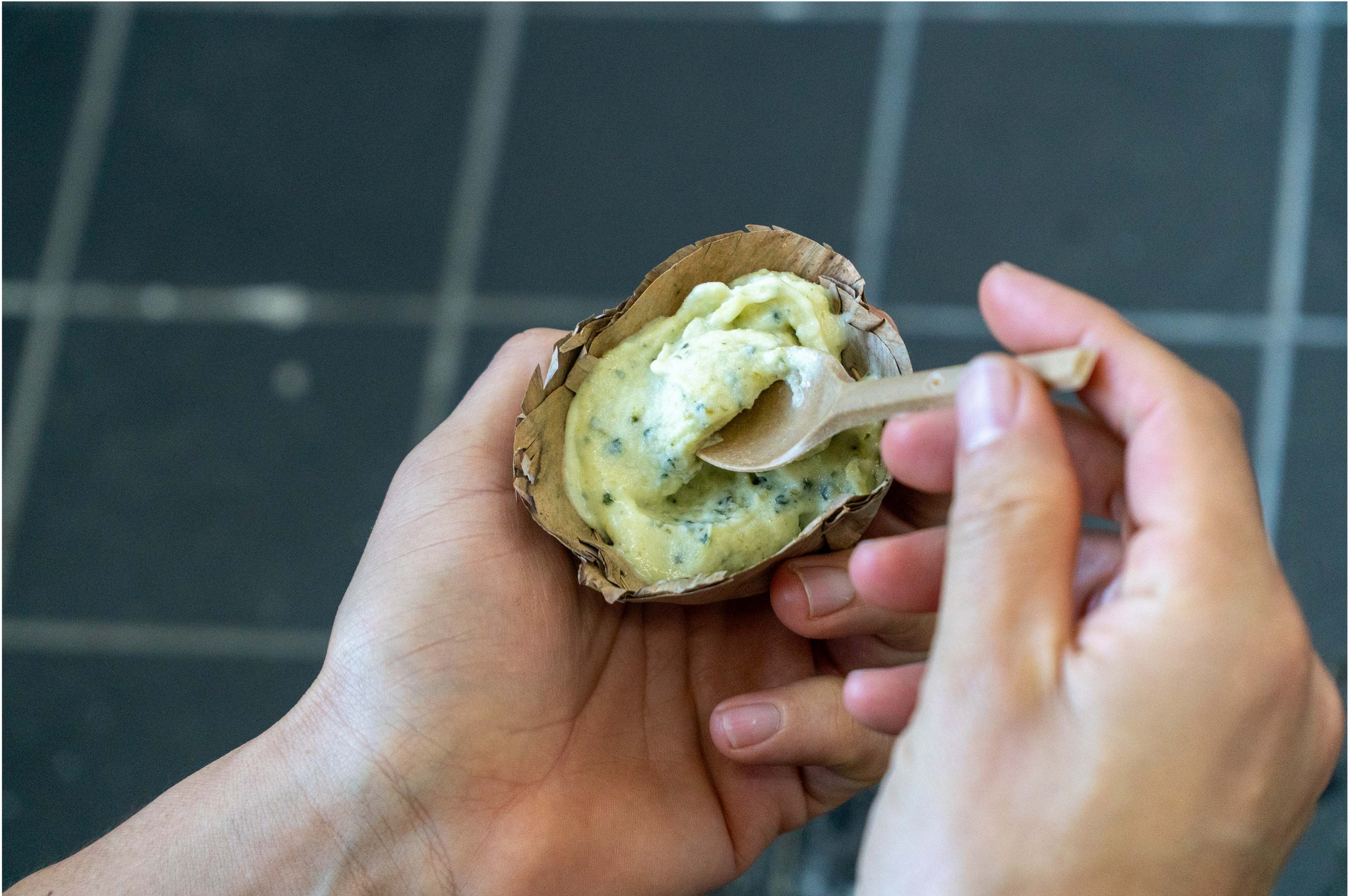
59. soap ( bad acting or the art of destringing pigeons ), 2024 installation view Billytown, The Hague