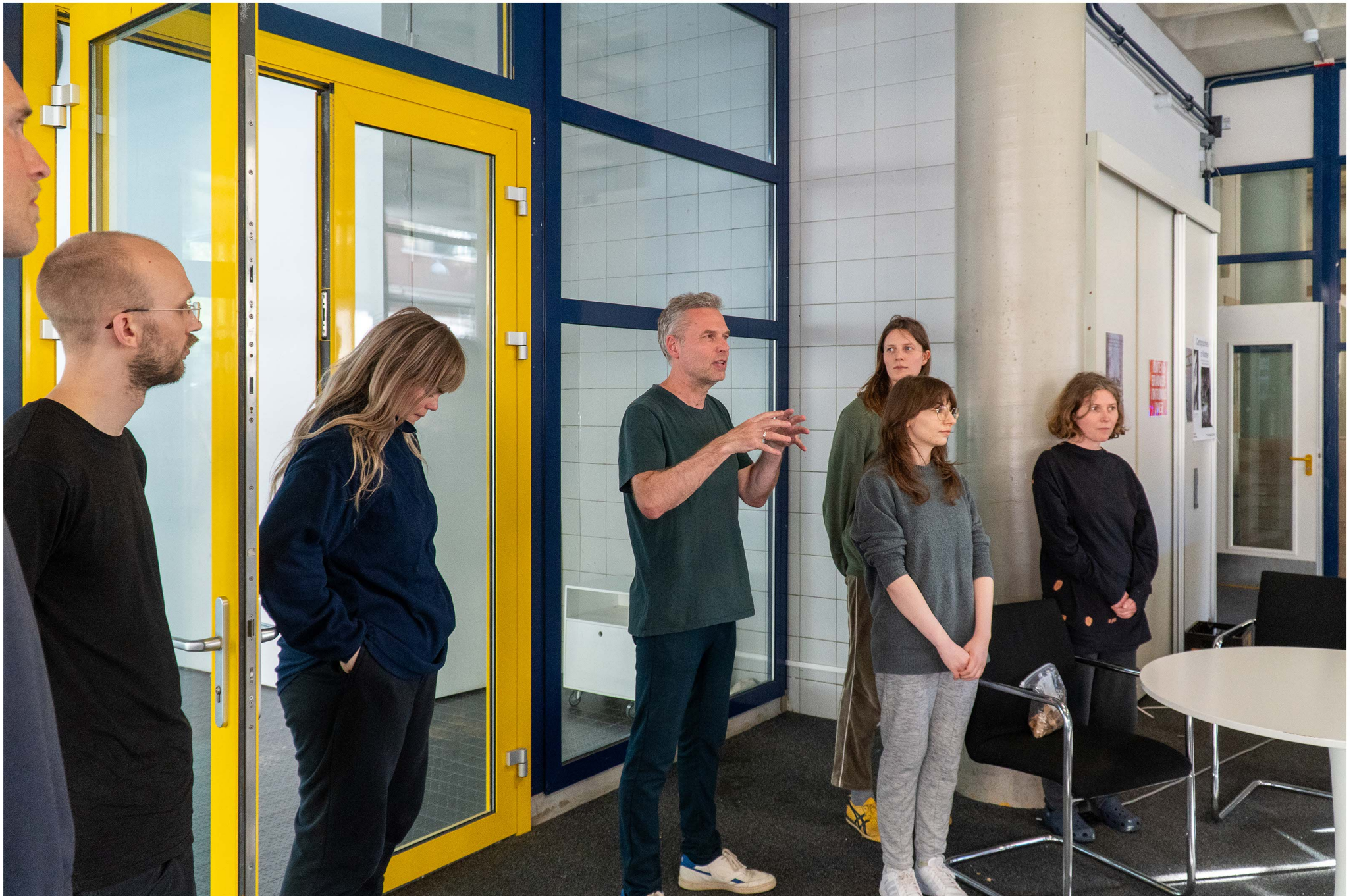
59. soap ( bad acting or the art of destringing pigeons ), 2024 installation view Billytown, The Hague