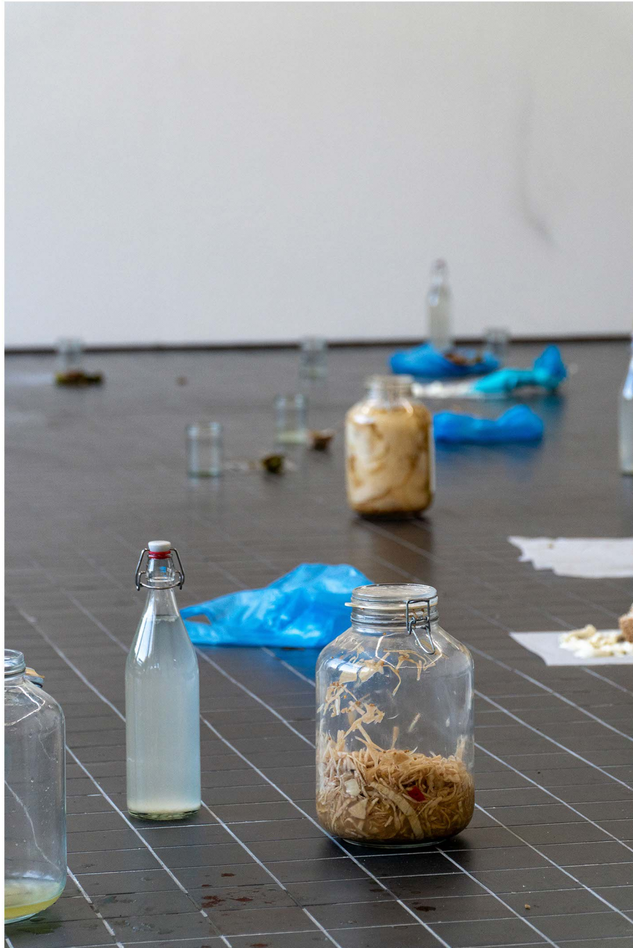
59. soap ( bad acting or the art of destringing pigeons ), 2024 installation view Billytown, The Hague