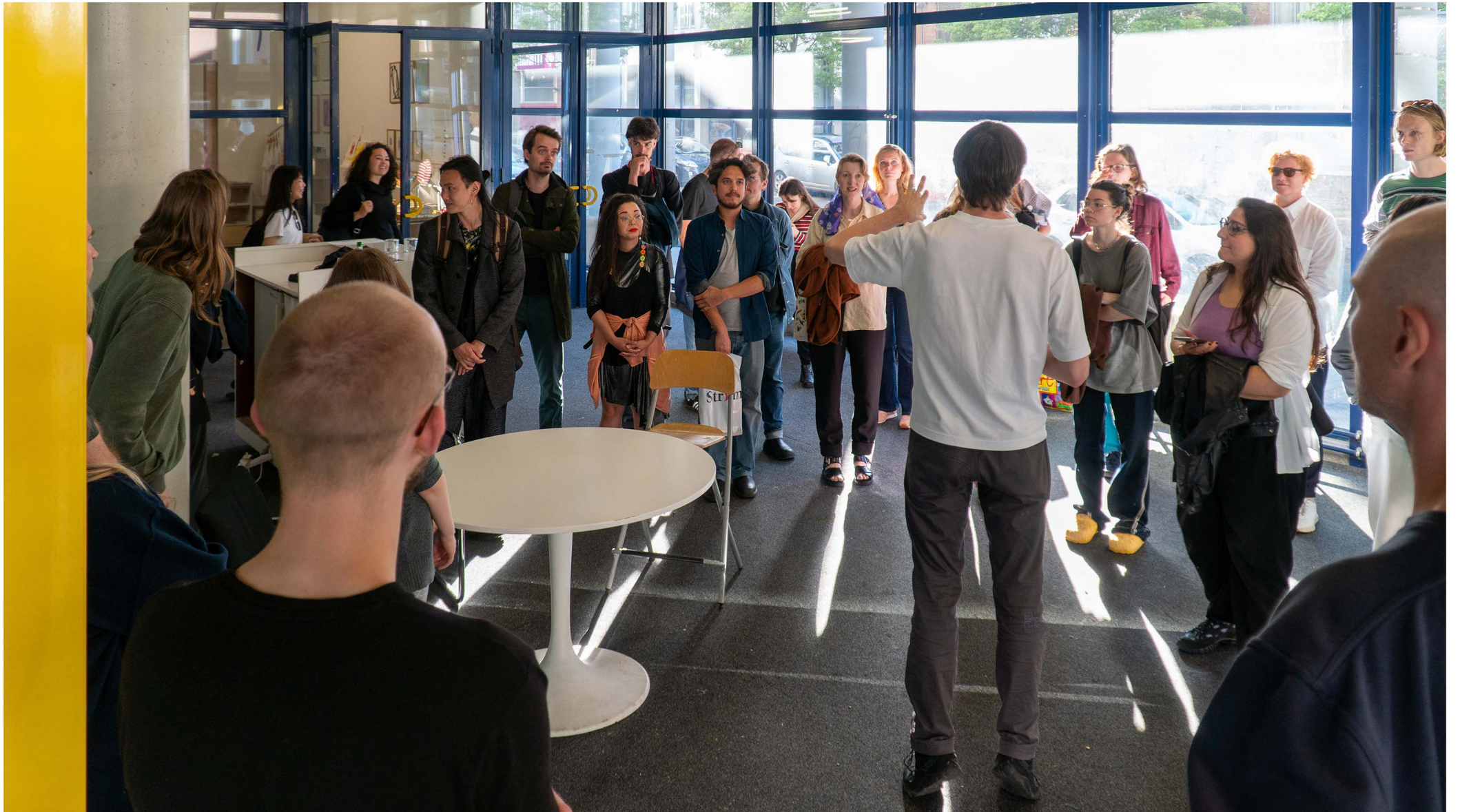
59. soap (bad acting or the art of destringing pigeons), 2024 installation view Billytown, The Hague