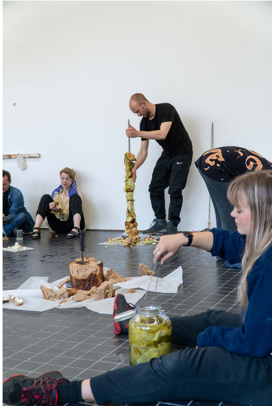
59. soap (bad acting or the art of destringing pigeons), 2024 installation view Billytown, The Hague