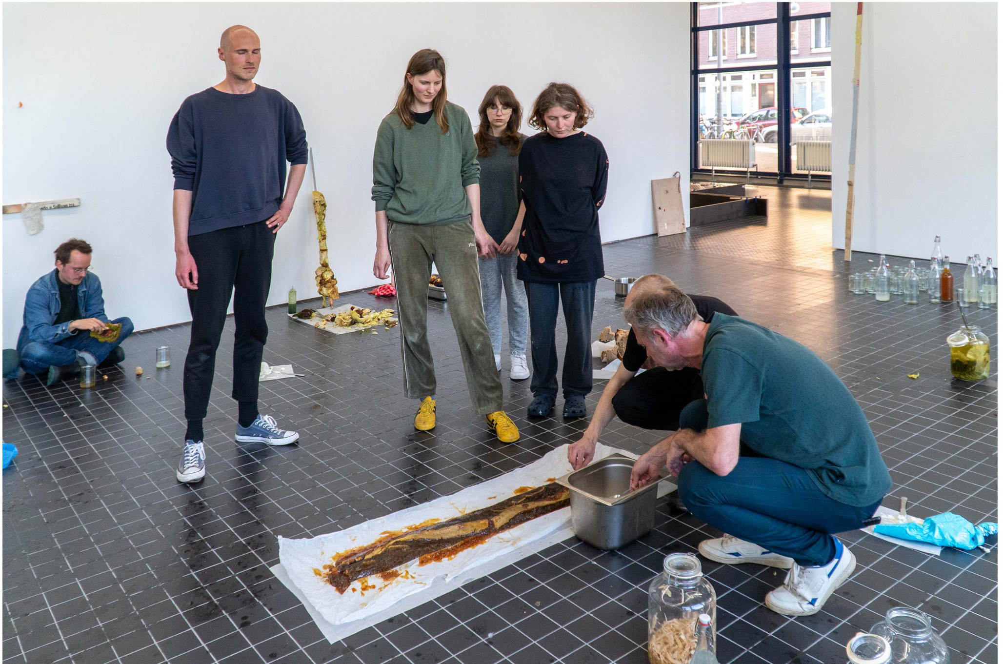
59. soap ( bad acting or the art of destringing pigeons ), 2024 installation view Billytown, The Hague