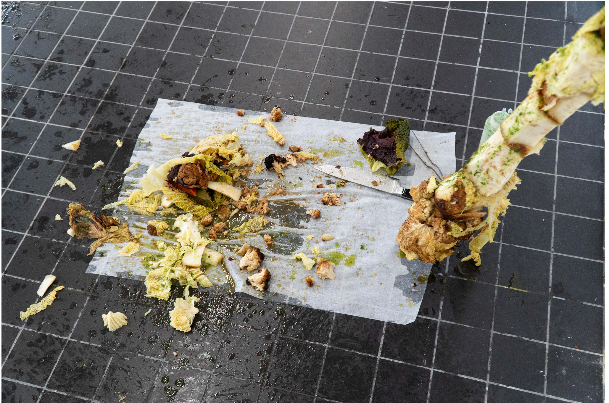
59. soap ( bad acting or the art of destringing pigeons ), 2024 installation view Billytown, The Hague