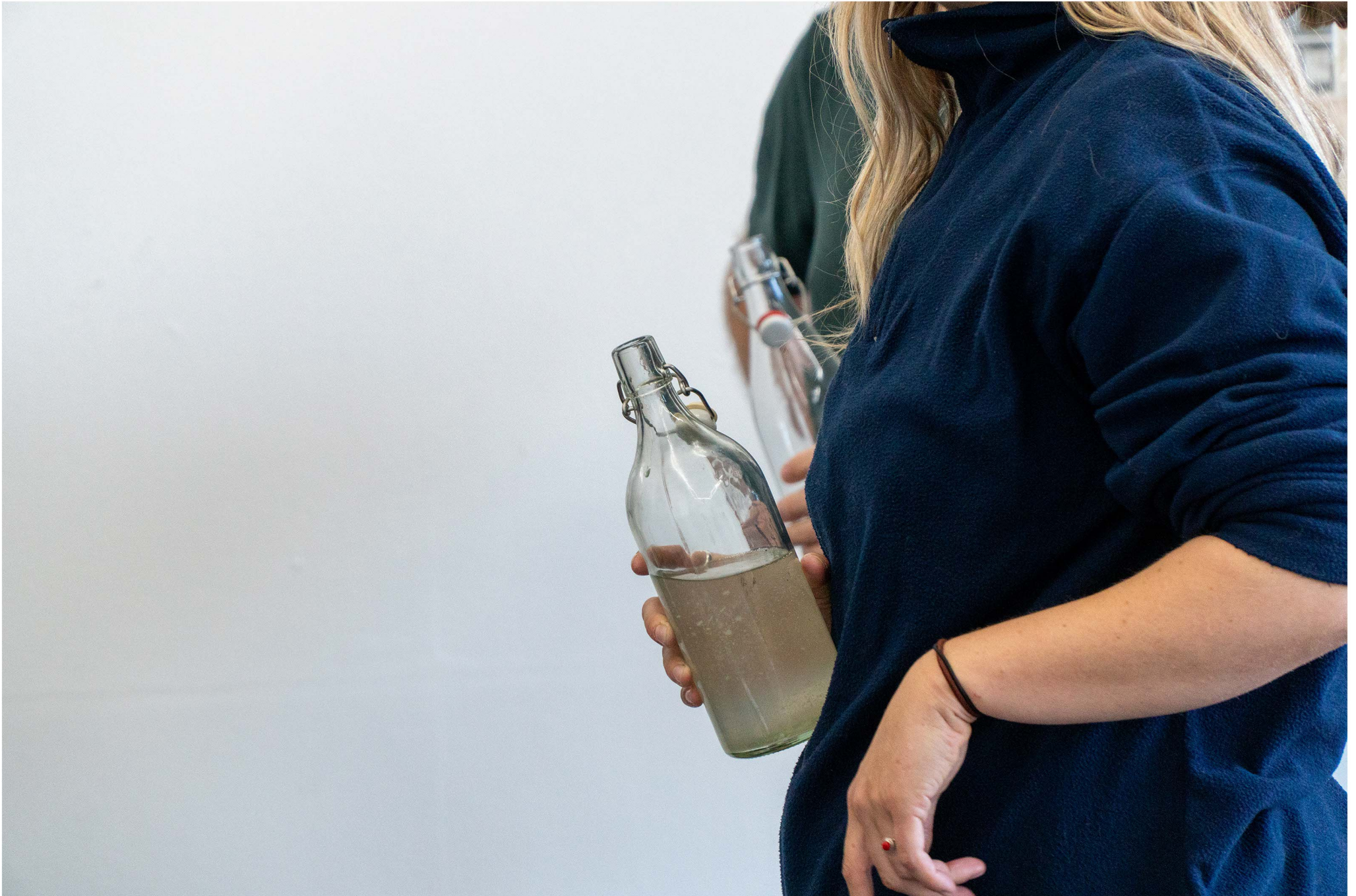
59. soap (bad acting or the art of destringing pigeons) , 2024 installation view Billytown, The Hague